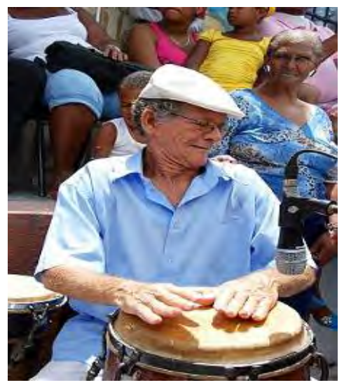
Rumba in Cuba: Inscribed in 2016 (<u>11.COM</u>) on the Representative List of the Intangible Cultural Heritage of Humanity

"I would like to thank the Cuban Circus for this beautiful show!