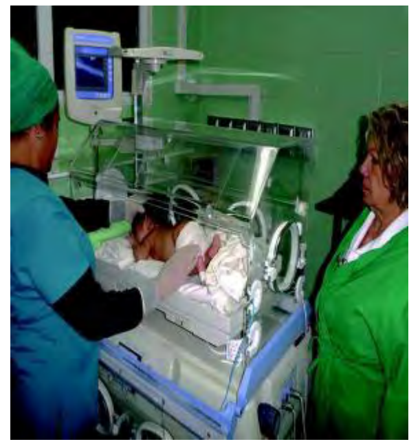
Despite the U.S. blockade, Cuba continues to have a universal and free healthcare system.

The life of every man, woman, and child, has always been a priority for Cuba's socialist government.