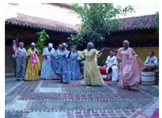
La Tumba Francesa, Inscribed in 2008 (<u>3.COM</u>) on the Representative List of the Intangible Cultural Heritage of Humanity (originally proclaimed in 2003)

Previously, only 460 manifestations of 117 countries bore the status of Intangible Cultural Heritage of Humanity, since this denomination was established, aimed at promoting and preserving heritage and cultural values.