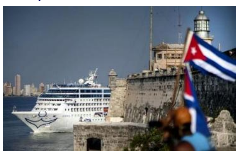
Translated by Sergio A. Paneque Diaz / CubaSi Translation Staff

A growing number of cruise companies already include Cuba in their routes. Traveling to the Caribbean island with their luxury, large passenger ships is a sign of the increasing and positive image of our country as a safe destination.